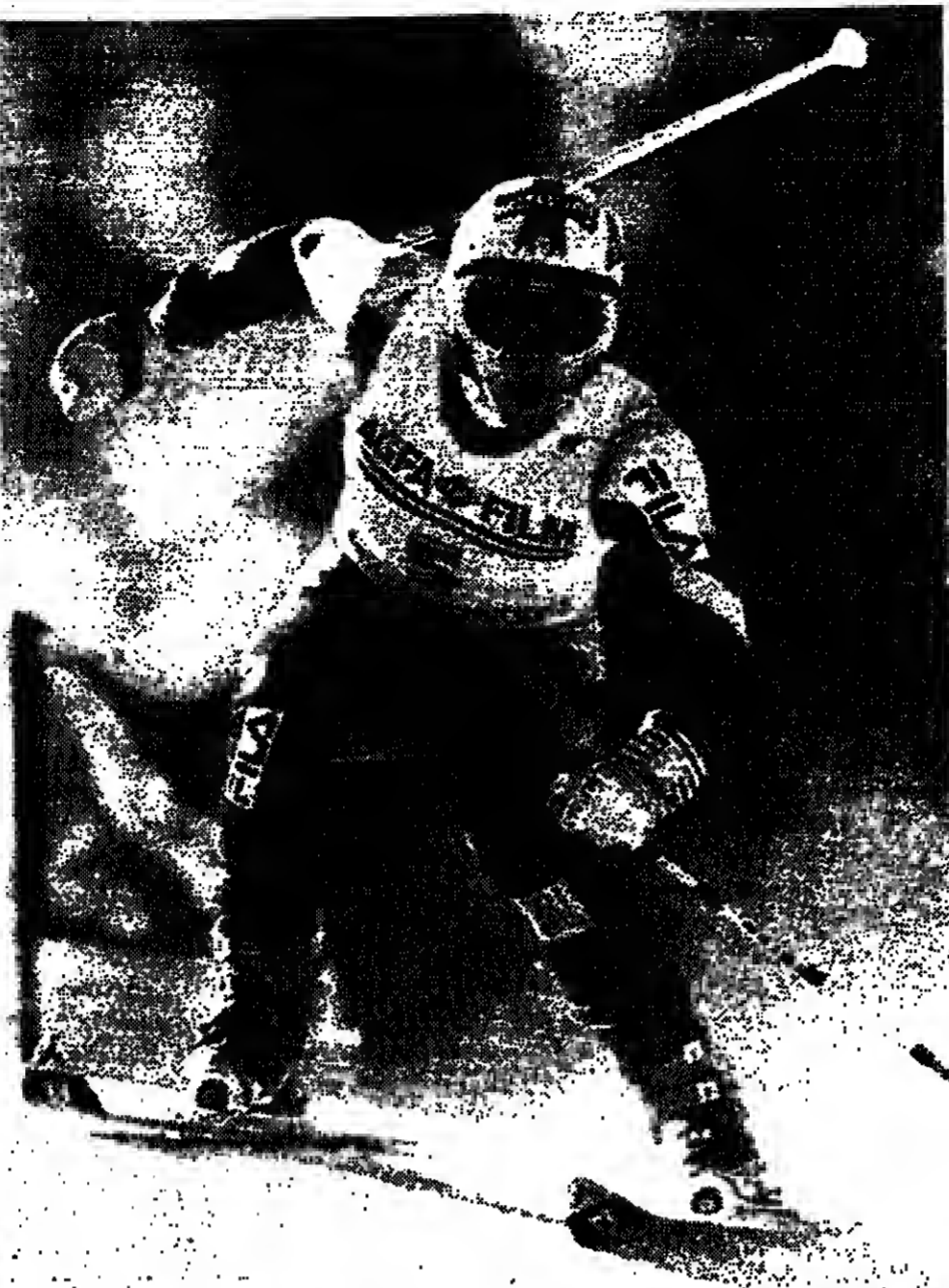
Deborah Compagnoni speeding to victory in the super-giant slalom at Morzine, France, on Sunday.